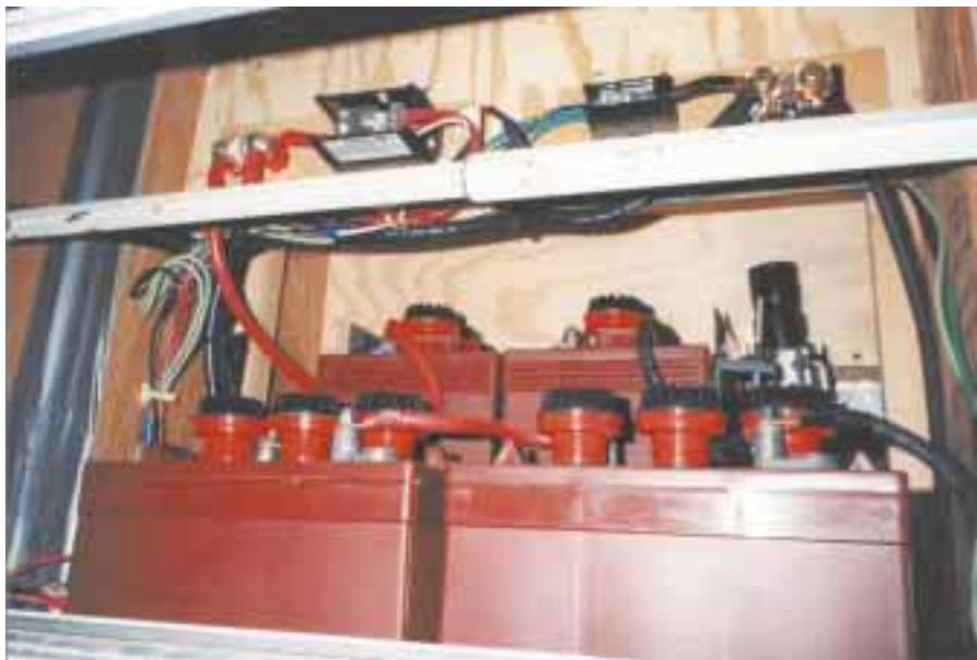
Above: The Four Trojan T-105s provide 440 Amp-hours of storage

panels so that at least two of the four corners were securely anchored into the 2x4s underneath. I used putty as a seal between the rubber and aluminum feet and then sealed with 501-LSW. I can angle the panels in one axis only, so I have to be careful to park in an east-west direction to get the most out of them. The lead-in wires are #10 stranded and go from the panels into the trailer through a PVC waste vent pipe. The waste pipe is in a closet, so I drilled a hole in the pipe, snaked the wires into the closet, sealed the hole so that the odors would vent normally, and then fed all the wires through walls to the monitor center.