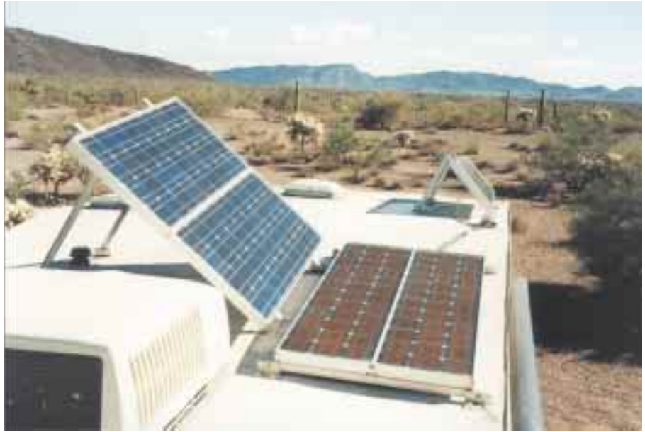
Above: A varied array of PVs on the roof of Hitchhiker II.

A few times, my inverter started to whine, letting me know that it was going to shut down if I kept on using the batteries at the current draw. I learned to look at the battery voltmeter on the solar regulator to find out