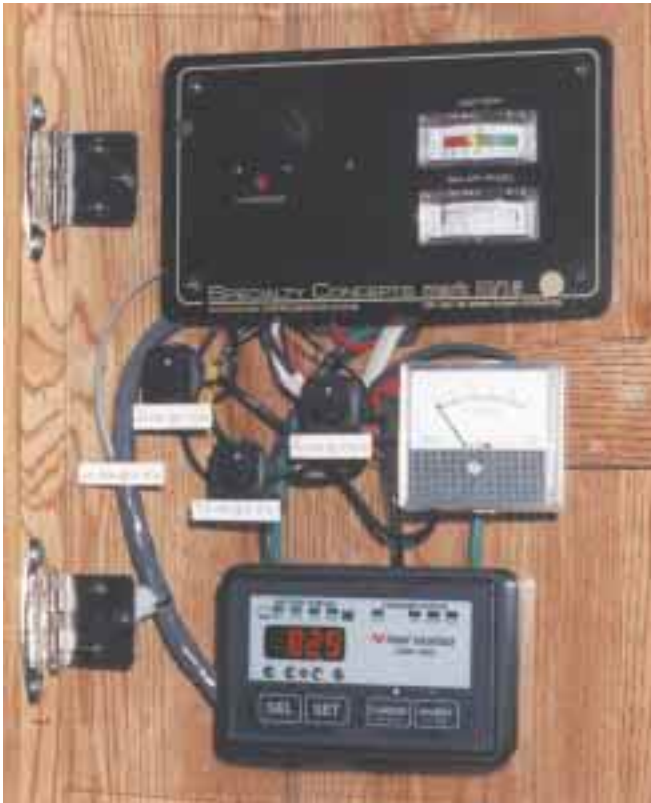
Above: SCI Charge controller, array disconnects, ammeter, and Link 1000 system metering.

before being stopped by a wall. I talked to people and learned that a 5th wheel “followed” better than a trailer with a bumper hitch. The tongue weight on a 5th wheel is placed on the rear axle, distributing the weight more evenly over the whole of the tow vehicle. Since the pivot point is also forward, 5th wheels are more maneuverable, especially when backing up.